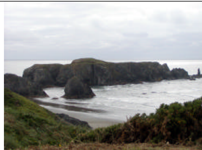
One of the "islands" off Coquille Point.