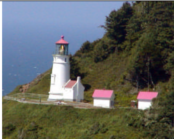
The Heceta lighthouse is very striking.