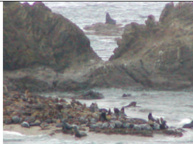
The beach can get very crowded.