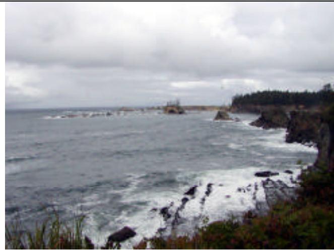
The Cape Abrego Lighthouse warns ships of these kinds of waters.