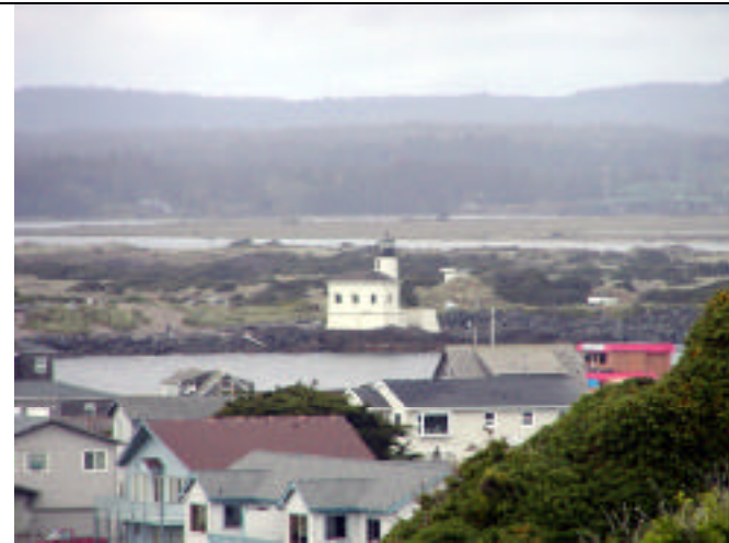
Here is the Coquille River lighthouse near Bandon Oregon.