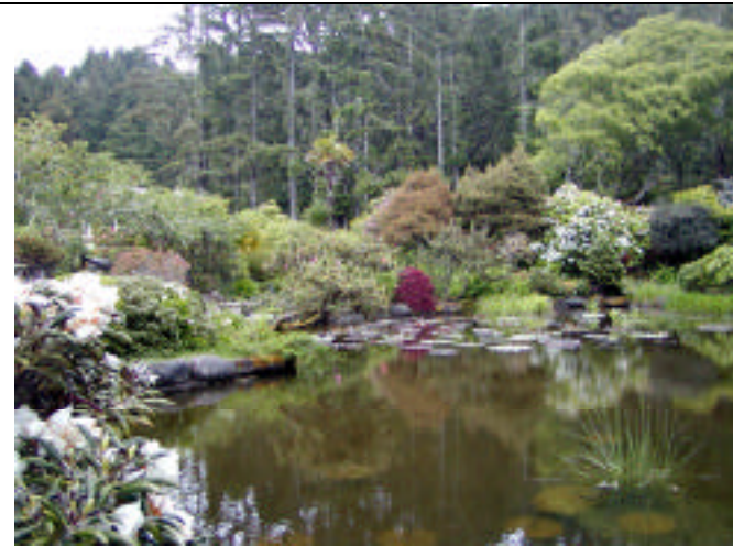
This area of shore acres is more like a reflecting pond.