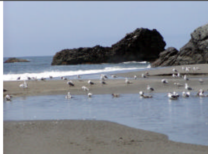
The seagulls seem to really like the beach.