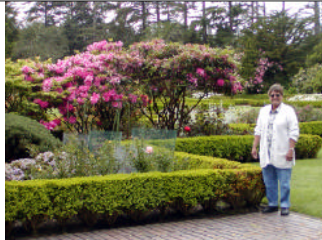
Shore Acres State Park has some beautiful gardens.