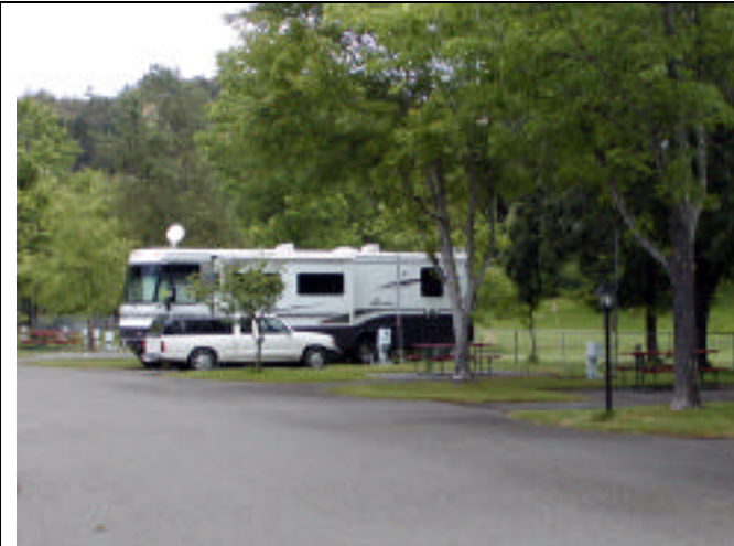
Here we are at Ben Bow RV and Golf Resort in Benbow California.