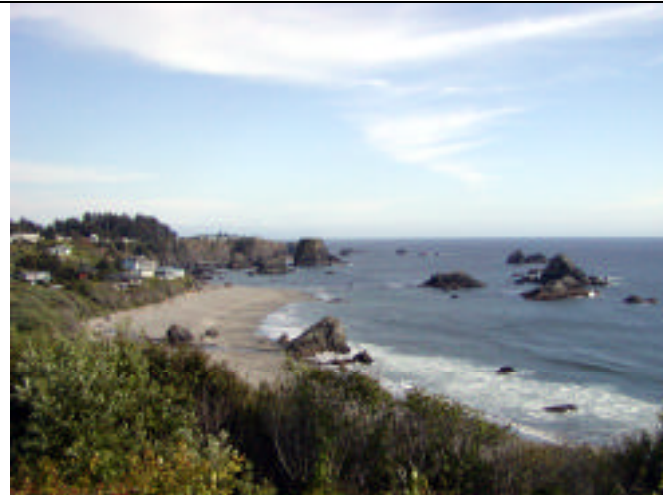
Harris Beach State Park has some beautiful views of the Oregon Coast.