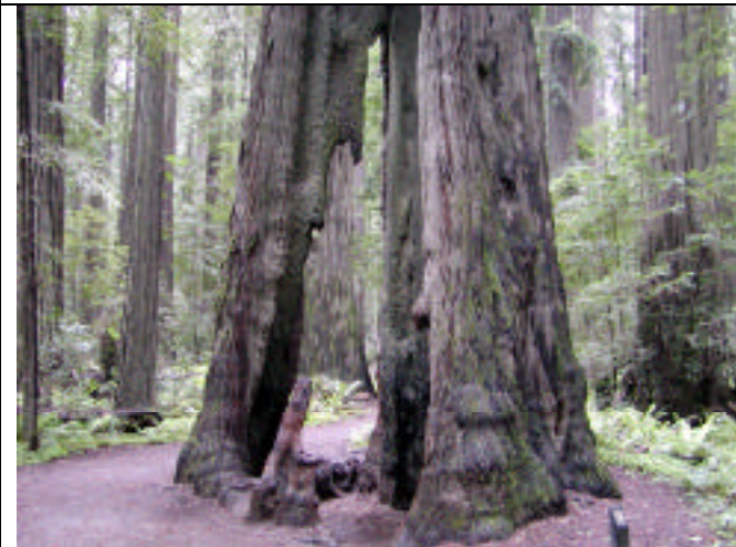
It's always amazing how a tree can burn but still live. The live tissue is just under the bark.