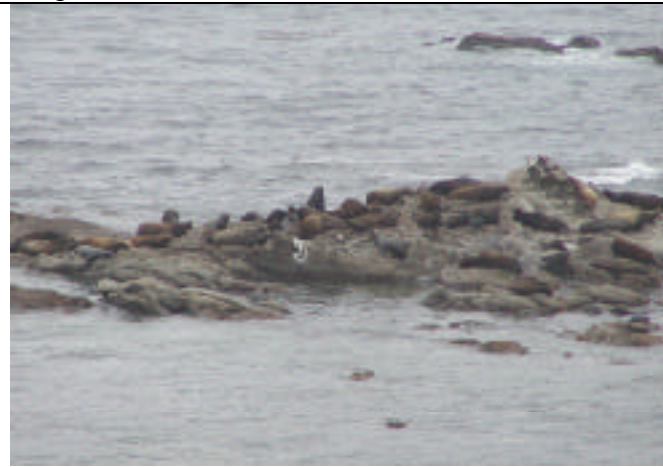
At Simpson Reef Overlook you get excellent views of sea mammals.