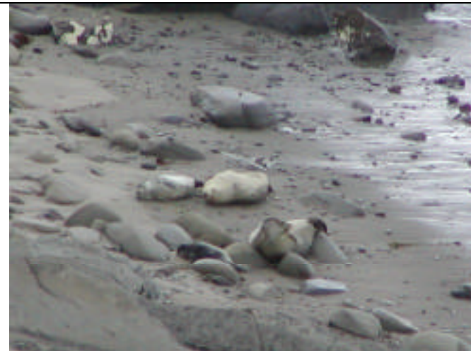
Here's some of the local residents enjoying the beach.