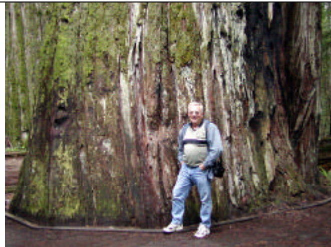
The Giant Tree is 363 feet tall and is recognized by the American Forestry Association as the National Champion Coastal Redwood Tree.