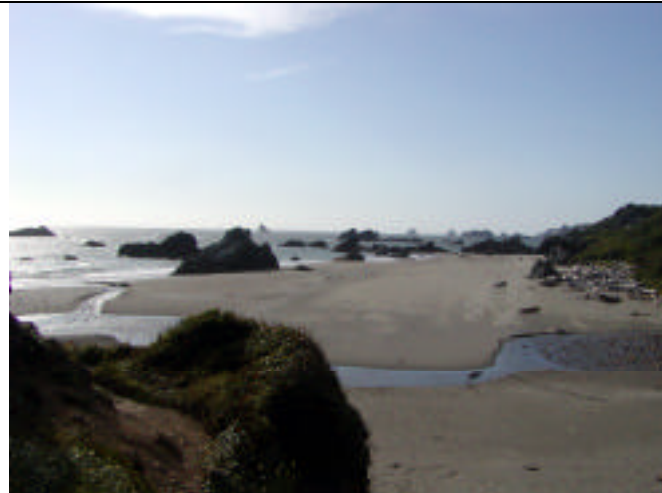
Harris State Beach has almost a surrealistic but very beautiful appearance.