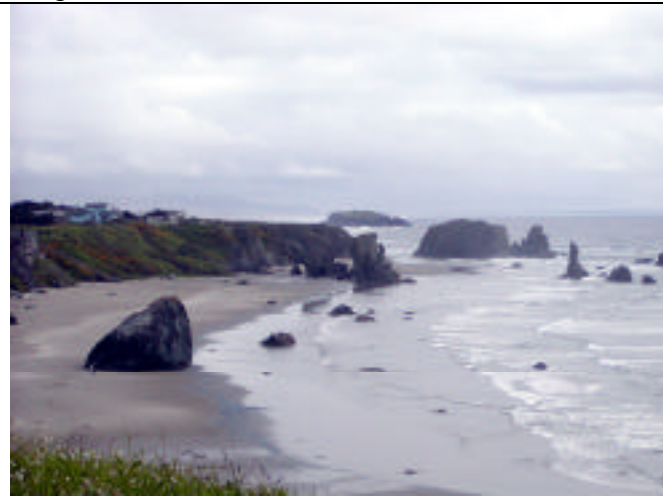
This is one of the beaches off Coquille Point, now part of a wild life sanctuary.