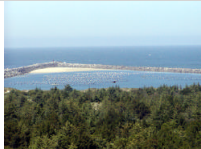
The Oyster Farm near the mouth of the Umpqua River produces really good oysters.