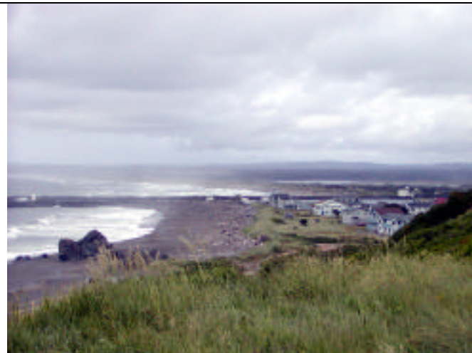
Looking North from Coquille Point you can see Bandon and the Coquille lighthouse.