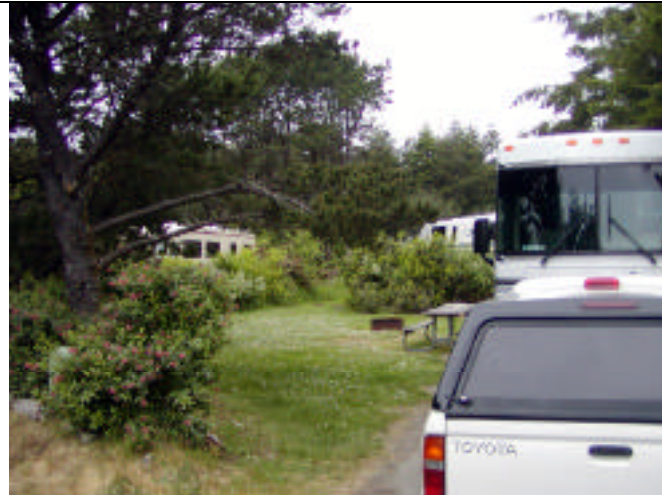
Here's our campsite at Harris Beach State Park.