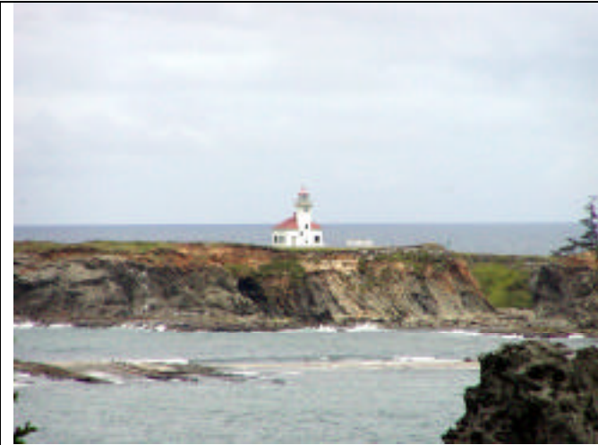
The Cape Abrego Lighthouse.