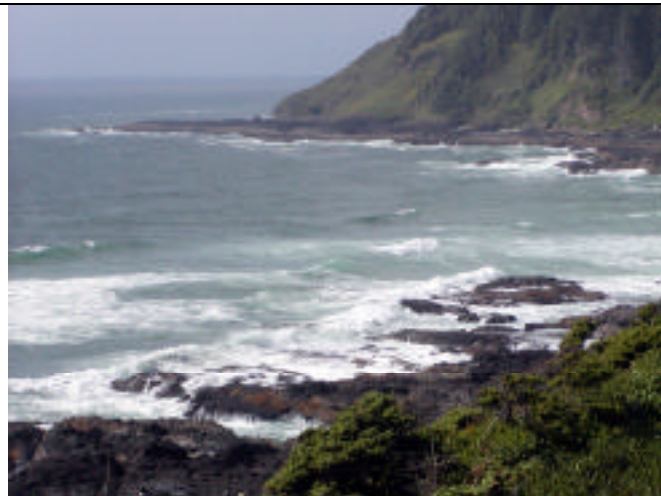
Another view of the beautifully rugged Oregon Coast.