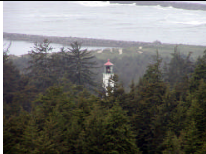
A closer view of the Umpqua River Lighthouse.