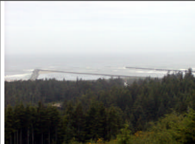
This is where the Umpqua River enters the Pacific. The lighthouse is just left of center. The triangle in the water is an oyster farm.