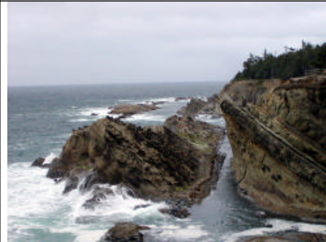
More of the rocky shores of the Oregon Coast.