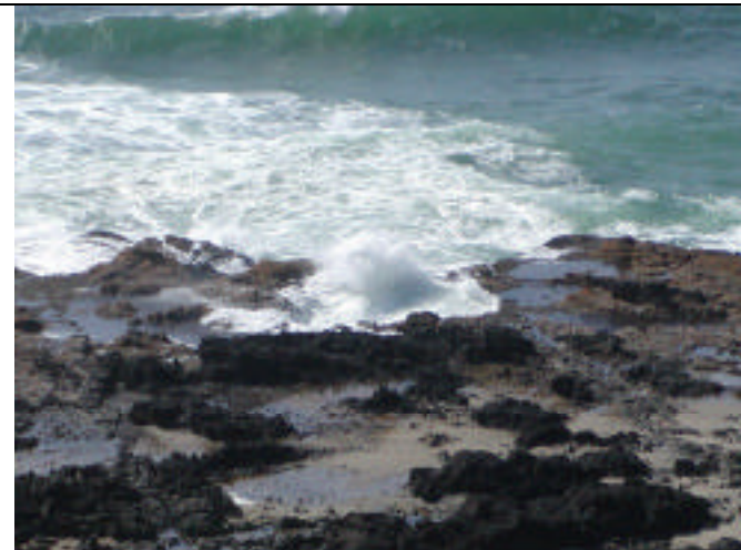
North of Florence is a “blow hole,” a tunnel that allows the surf to bubble up in the middle of the rocks.