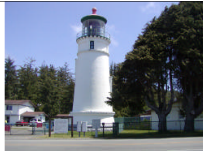
A much closer view of the Umpqua River Lighthouse.