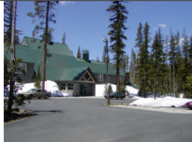
The snow at Mazama Dorm covered the first floor windows.