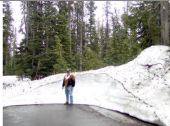
Here's Larry at the entrance of a different campground loop.