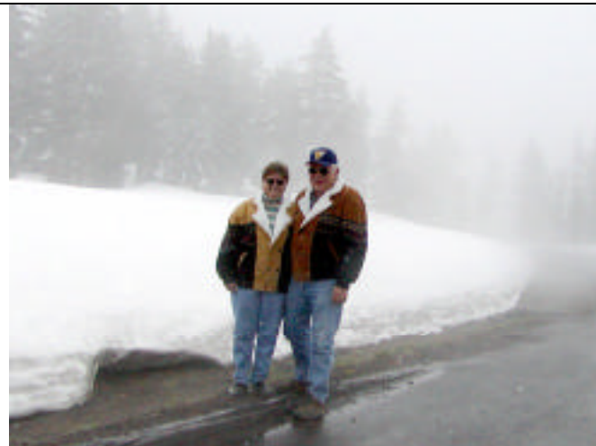
Here we are along the road to the rim.