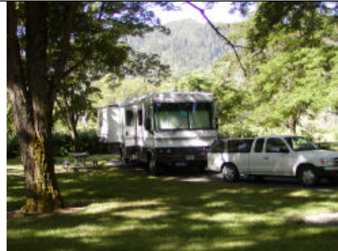
Before going to Crater Lake, we spent the night at the Valley of the Rogue State Park, another beautiful Oregon State Park.