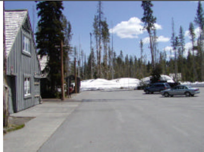
Although the parking at Mazama Village was dry, you can see the snow in the background.