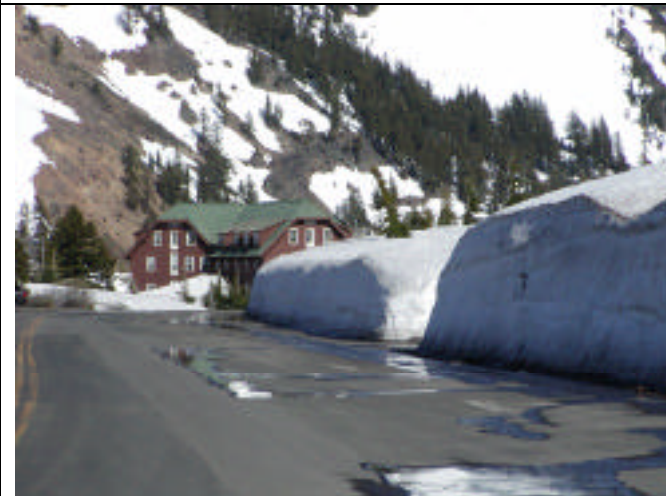
There was lots of snow at Crater Lake Lodge.