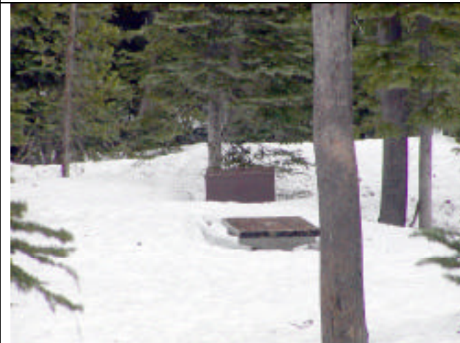
At least in this campsite you can actually find the picnic table and bear box.