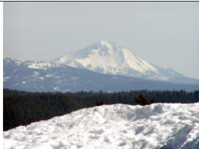
Here's Mount Shasta from the Rim Drive at Crater Lake National Park.