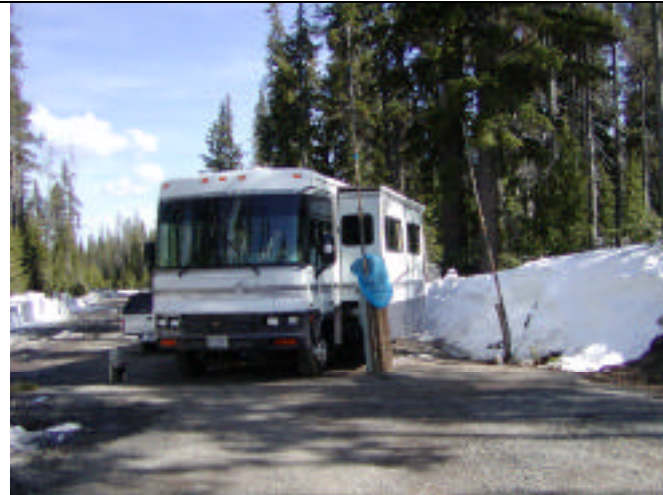
On June 2, this is where we set up our RV on Employee's Row at Crater Lake National Park. This area opened the day we arrived.